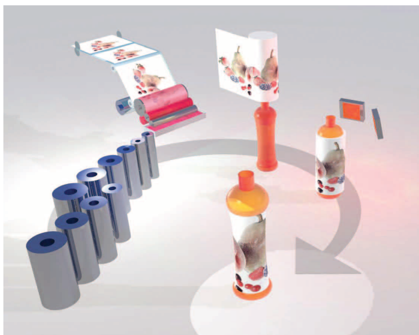
Roll-sleeve label process

kp plants are ISO 9001 and/or 14001 certified and we manufacture according to common hygiene standards. Pentalabel® FDA, HPB, and European food regulation compliant formulations are available. Pentalabel® films meet or surpass international regulatory standards.