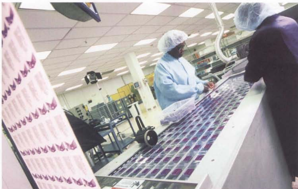
Operators place loaded clip cartridges into formed blister cavities, after which lidstock is applied.

Primary packaging for the clips consists of color-coded cartridges from Avail, each holding six devices. Made of colored acrylonitrile-butadiene-styrene